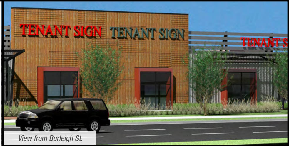
View from Burleigh St.